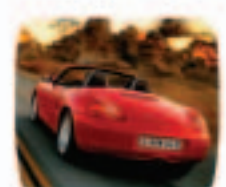
Approximate value of $80,500

Just call for a quote at 1 888 597-3673 and you'll be entered to win a brand-new 2004 PORSCHE BOXSTER!** Or for more information, visit us online at www.thepersonal.com